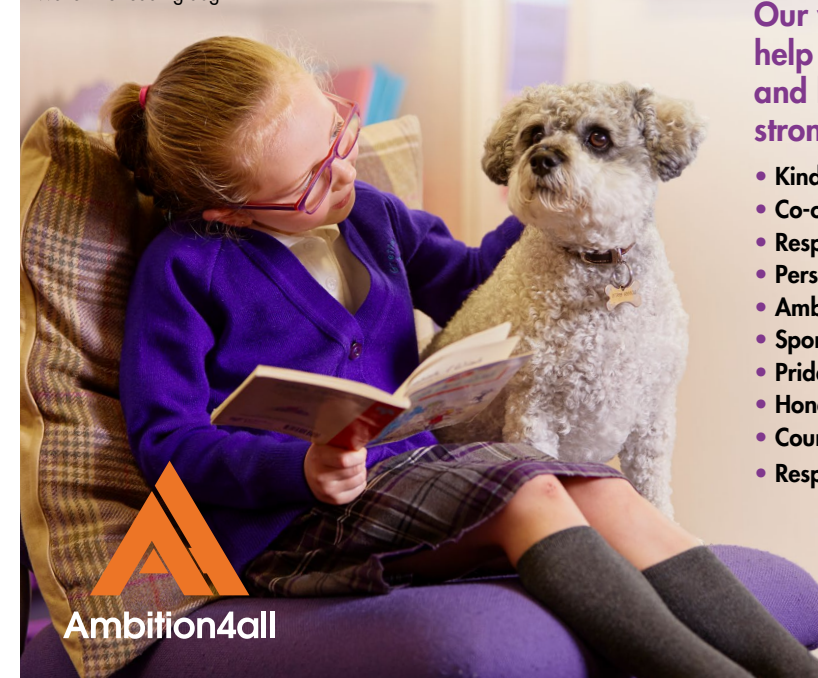
Walter the reading dog

Our values help us grow and become stronger: